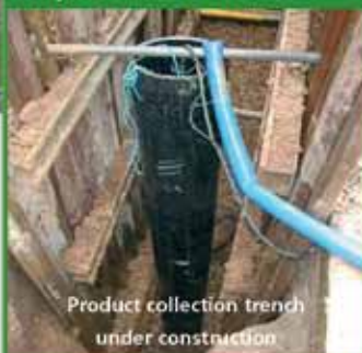
Product collection trench under construction